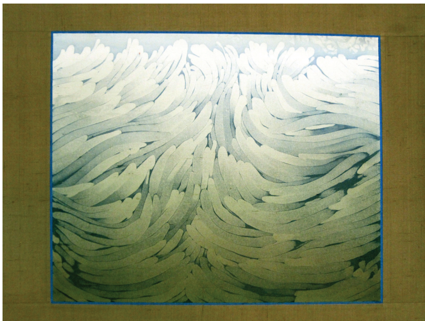
Transcendence Rozome wax-resist with acid dyes on silk; mounted scroll, 2010 Detail 40" x 19"