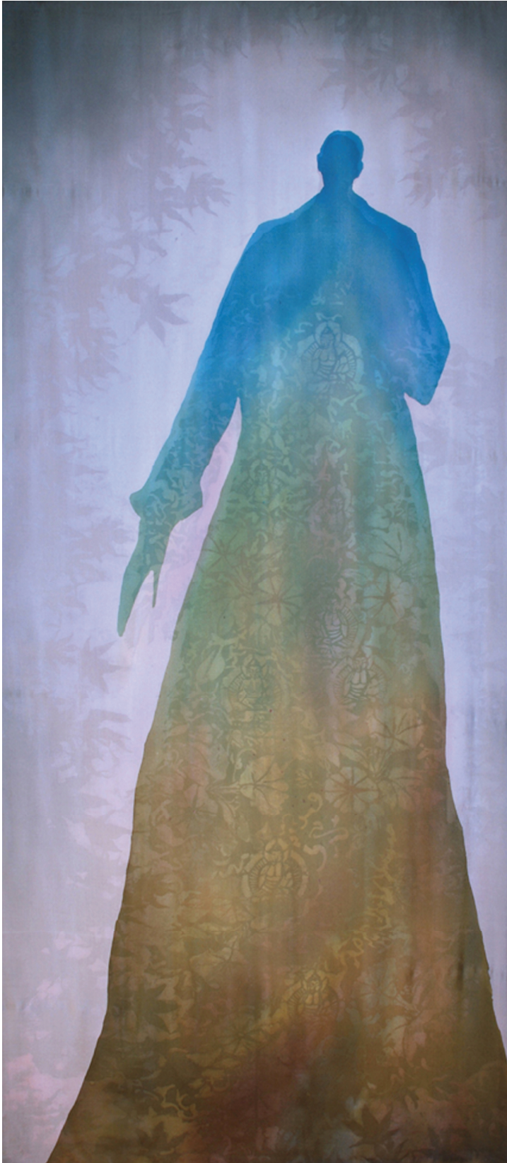
ABOVE The Path Rozome wax-resist, acid dyes on layered silk photo credit: Jen Bouchard, 2011 68" x 30"