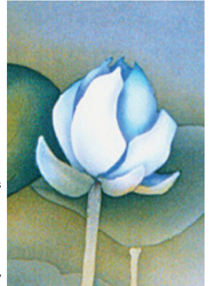
Blossom Detail of Blue Lotus of Lumbini Rozome wax-resist with acid dyes of silk, 2007 42" x 30"

For more information, visit Kiranada's website at: www.betsysterlingbenjamin.com